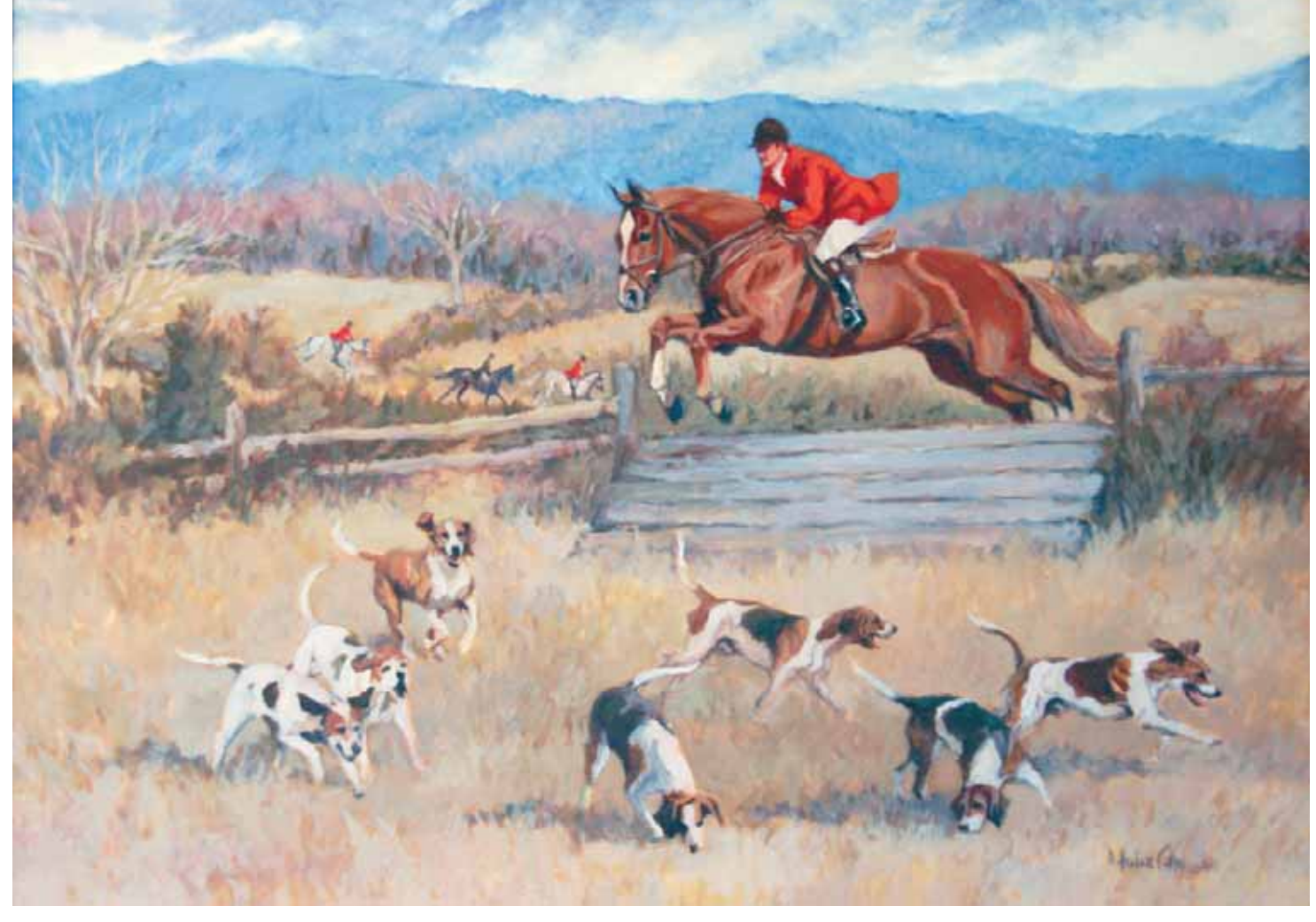
A Good Run on Midway Farm —oil, included in the book A Centennial View