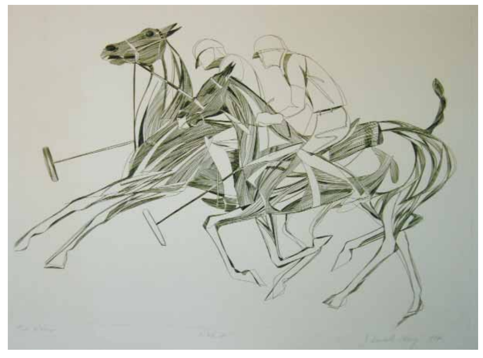
47 Virginia Sportsman • Dec 10/Jan 11