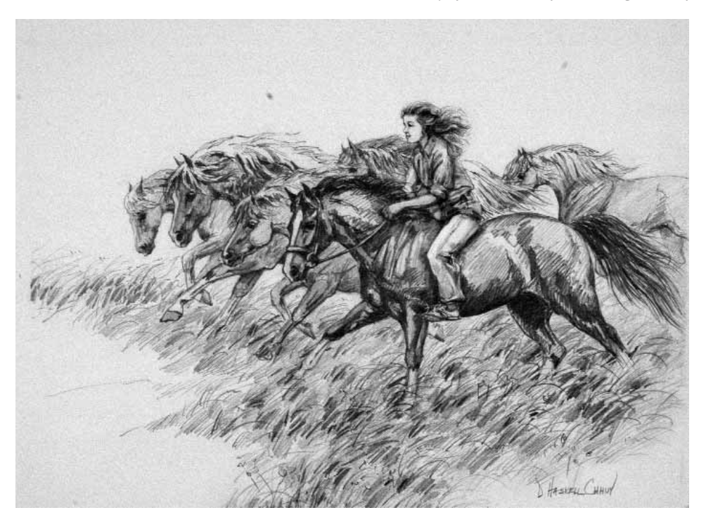
49 Virginia Sportsman • Dec 10/Jan 11