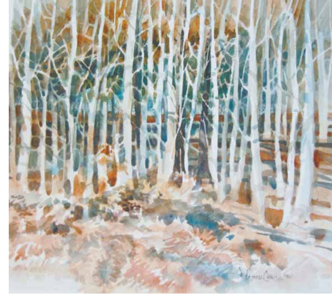
Tree Study --- watercolor, accepted by New Jersey Watercolor Juried Exhibition

Over the past 20-plus years her paintings have appeared on 27 Chronicle covers. Two fun projects from that time were penand-ink drawings that were used on a wine label and a miniature portrait of a Lab which was engraved on a signet ring at Tiffany's.