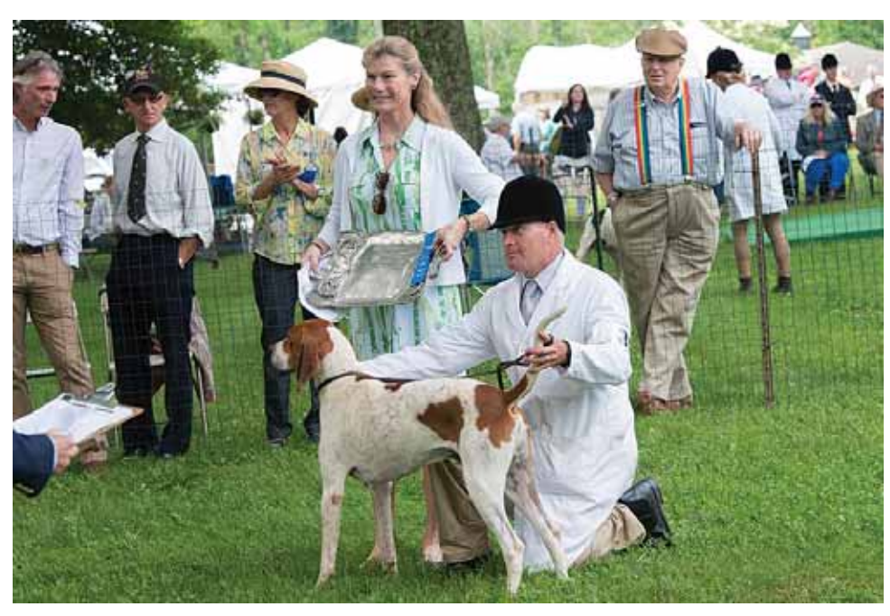
14 VAS • Winter 2017

Farmington hunts over land in southern and northwestern Albemarle and Greene counties that is designated by the Masters of Foxhounds Association, an international association that governs all