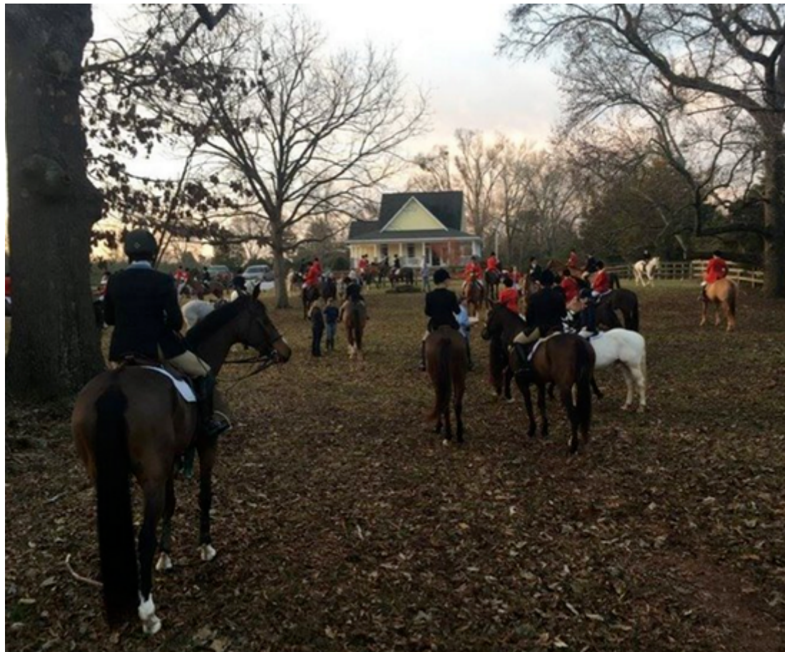
Riders prepare to move off in the beautiful Belle Meade country.